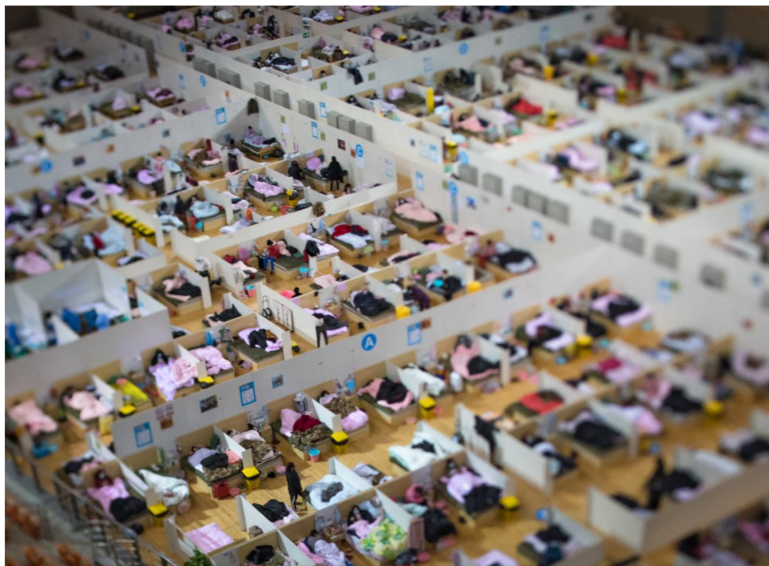
Photo taken on Feb. 17, 2020 with a tilt-shift lens shows a temporary hospital converted from Wuhan Sports Center in Wuhan, Hubei Province.

fundamental reform to build a law-based epidemic prevention and control, and national public health emergency management system 1 . In this case, the European know-how could be of help for China.