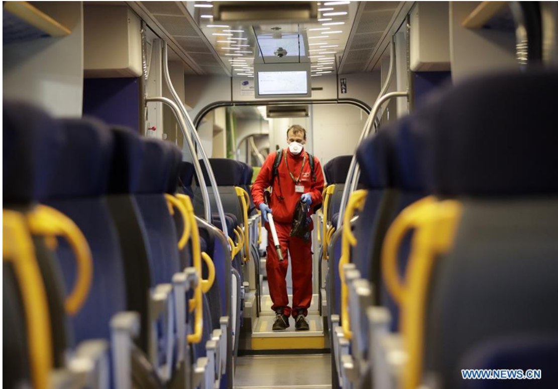
A staff member sanitizes the facilities on a train at the Garibaldi train station in Milan, Italy, Feb. 28, 2020.

that China's battle against the virus has generated favorable outcomes. But at the same time, the virus is spreading fast outside China, including Europe. Reportedly, as of 1 March, 1,520 cases and 31 deaths have been reported in Europe, including Italy (1,128 cases, 29 deaths), Germany (111 cases), and France (100 cases, 2 deaths).