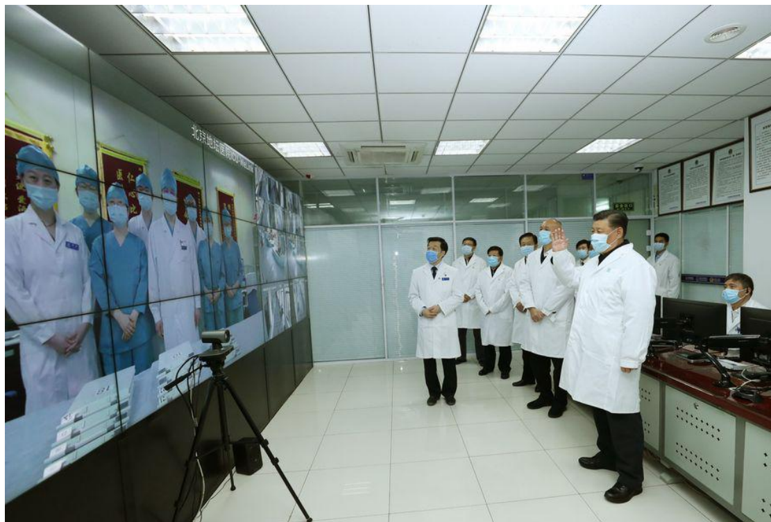
President Xi Jinping checks the treatment of hospitalized patients at the monitoring center and talks to medical staff on duty via a video link at Beijing Ditan Hospital in Beijing, on Feb. 10, 2020.

The EU has offered in-time and generous assistance to China to combat the outbreak, and they have maintained close contact on dealing with the crisis, which mirrors the sound friendship and partnership between the two actors. The article examines the health cooperation between China and the EU, as well as selected European countries, including Germany, France, United Kingdom (UK) and Italy, and analyzes the potential impact of COVID-19 to the China-Europe health cooperation.