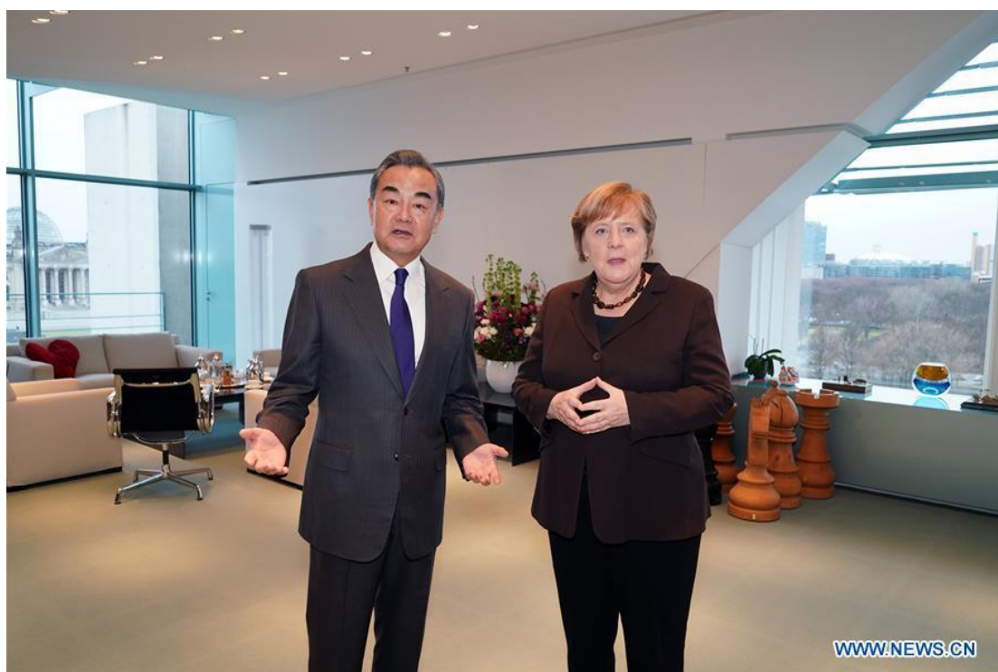
German Chancellor Angela Merkel (R) meets with visiting Chinese State Councilor and Foreign Minister Wang Yi in Berlin, Germany, Feb. 13, 2020. The COVID-19 was discussed at their meeting.

of the European Commission. In Xi's phone conversation with Macron, the two presidents expressed their strong willingness to work together to fight against COVID-19, and agreed to strengthen their health cooperation for the sake of regional and global public health security 1 . The Chinese and European experts also maintained close contact on the evolution of the epidemic. Two video meetings have been organized by now, attended by officials and experts from National Health Commission of China, the Chinese Center for Disease Control and Prevention, the EC's Directorate-General for Health and Food Safety and the European Center for Disease Prevention and Control. In addition, China has received official medical aid from the EC and a number of European countries, such as UK, France, as well as enterprises, civil society organizations, and private foundations.